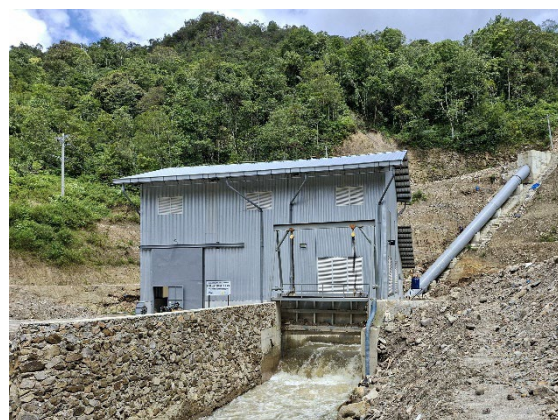
Pungga Power Plant (Exterior)