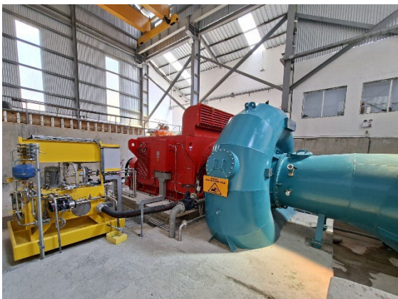
Pungga Power Plant (Interior)

As outlined in “J-POWER BLUE MISSION 2050” , J-POWER will continue to work with MEL to contribute to the expansion of renewable energy, the stable supply of electricity, and the reduction of environmental impact in Indonesia.