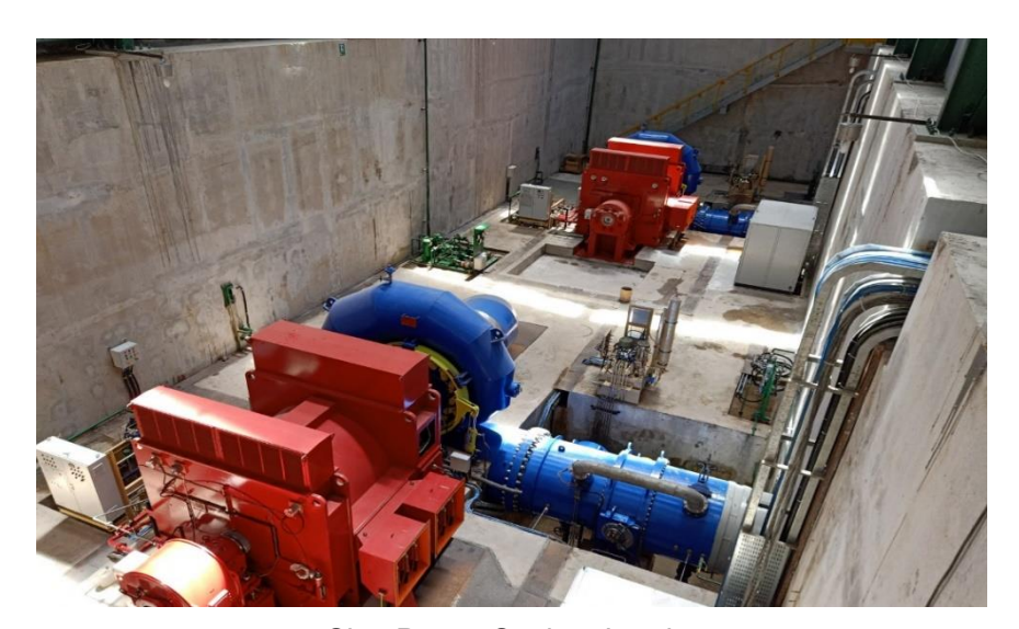
Sion Power Station: Interior