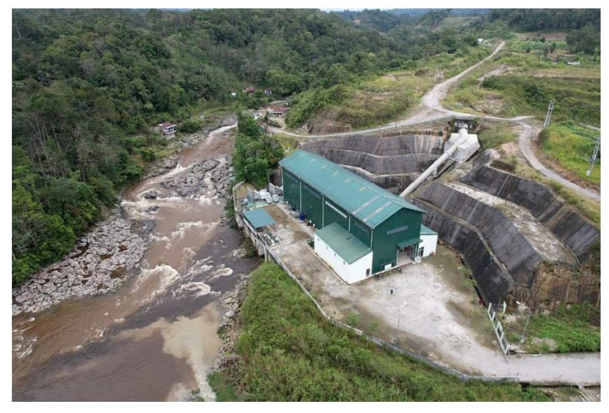
Sion Power Station: Exterior