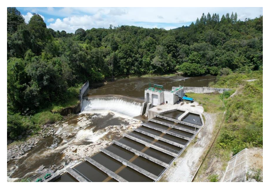
Sion Power Station: Weir and water intake