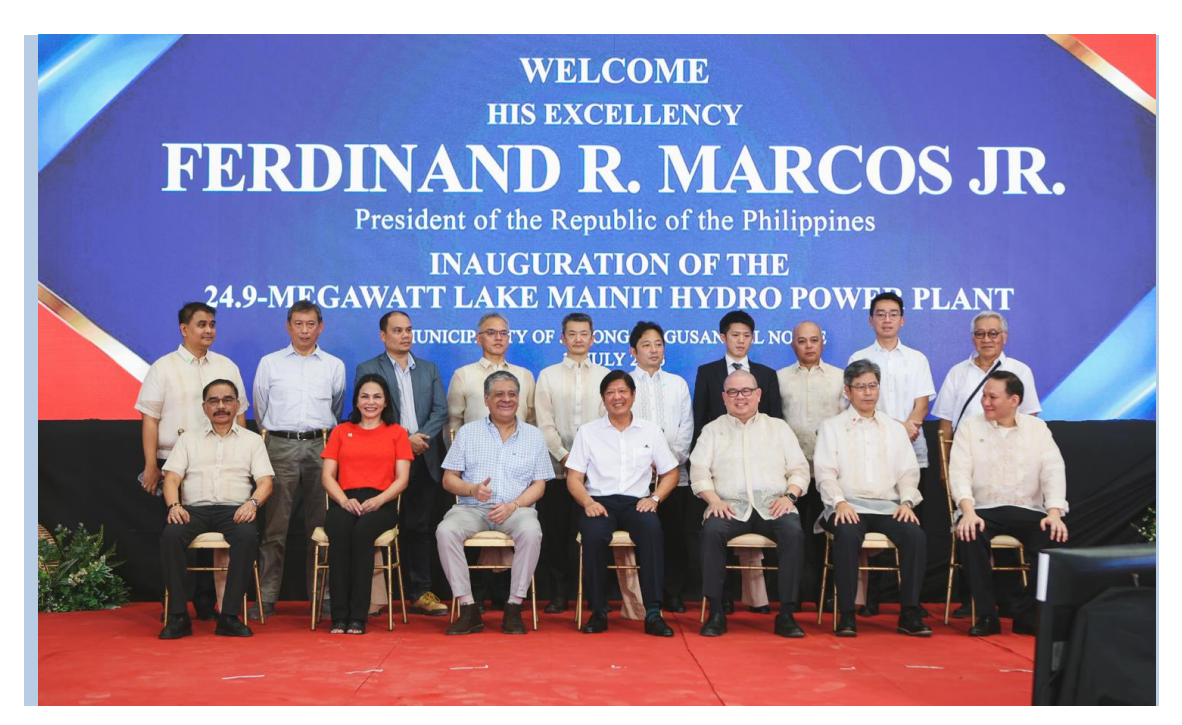
Ceremony to mark the completion of construction

The plant endeavors to supply reliable electricity to Agusan del Norte Electric Cooperative, Inc. (ANECO), and supports the ever-growing demand for energy from both residential and commercial sectors in the region.