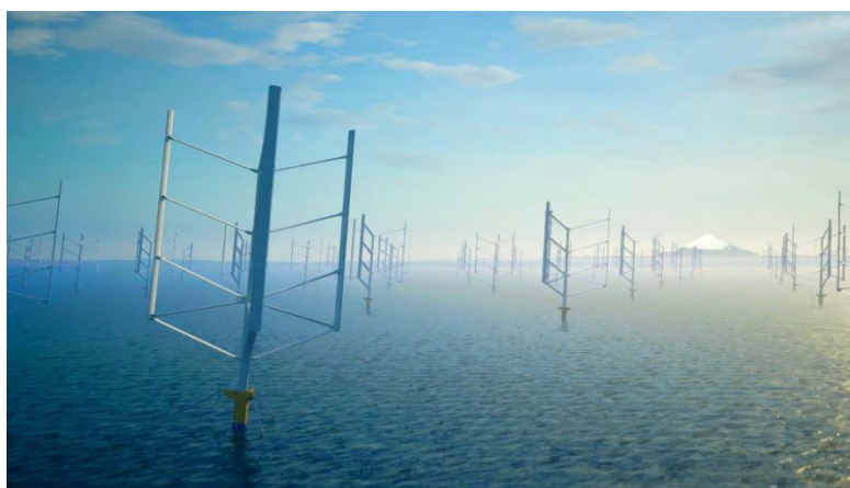
Artist's concept of a floating axis wind turbine (FAWT) wind farm ( YouTube movie ) (Courtesy of Albatross Technology Inc.)

Electric Power Development Co., Ltd. (J-POWER), 1 Tokyo Electric Power Company Holdings, Inc. (TEPCO HD), 2 Chubu Electric Power Co., Inc. (Chubu Electric), 3 Kawasaki Kisen Kaisha, Ltd. (“K” LINE), 4 and Albatross Technology Inc. (Albatross), 5 have entered into a joint research agreement for a next-generation (floating axis) offshore wind turbine demonstration project (the “project”).