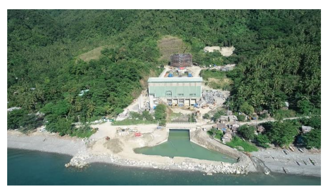
Lake Mainit Hydroelectric Power Plant (under construction)

LMHHC, through Agusan Power Corporation (APC), a company wholly owned by MRC, is constructing the Lake Mainit Hydroelectric Power Plant (25 MW) in northern Mindanao. Commercial operation is set to start in January 2023.