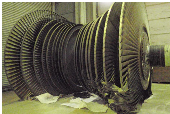
[Damaged low-pressure turbine rotor]