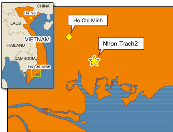
(Location of Nhon Trach 2 Power)