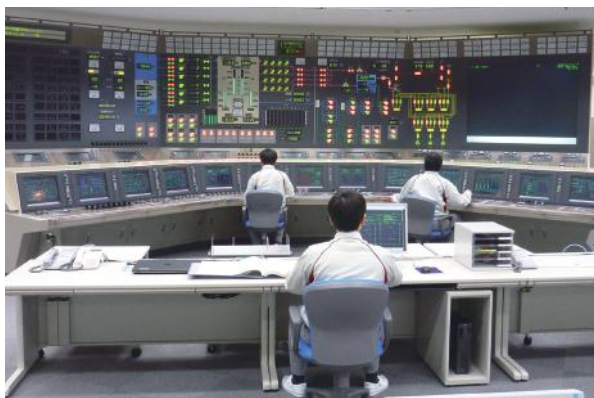
Operation training simulator

We are reinforcing safety measures at the Ohma Nuclear Power Plant based on the latest knowledge including lessons learned from the accident at the Fukushima Daiichi Nuclear Power Station and the results of the geological investigations of the plant site and neighboring areas that have been conducted continuously since permission to build this nuclear reactor was obtained in April 2008.