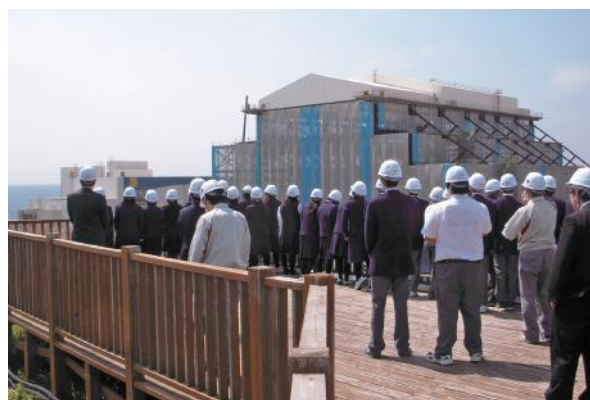
Tour for local high school students on Ohma Nuclear Power Plant construction site

in towns. Going forward, we will continue to engage in a wide range of activities while placing particular importance on our relationships with local residents.