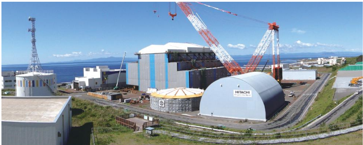
Panoramic view of construction work on Ohma Nuclear Power Plant (Aomori Prefecture)