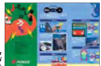
J-POWER wa chikara mochi (Powerful J-POWER)