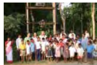
J-POWER Purulia Pumped Storage Project Office (Purulia District, West Bengal, India)

We helped provide power to a school built by VVK, an NGO providing living assistance for ethnic minority groups in the Purulia District of West Bengal in India. We also donated refrigerators and couches to a state-run medical clinic.