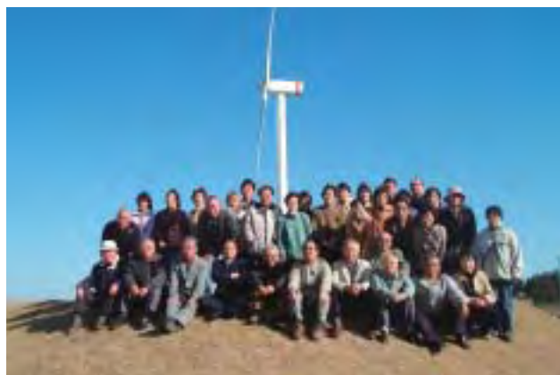
J-POWER Shizuoka Transmission Line Maintenance Office Tour of J-WIND Tahara Wind Power Station