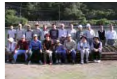
J-POWER Minami-Kyushu Power Administration Office JPHYTEC Minami-Kyushu Office (Kumamoto Prefecture) Flower bed maintenance with the Kodabe Senior Citizens' Club