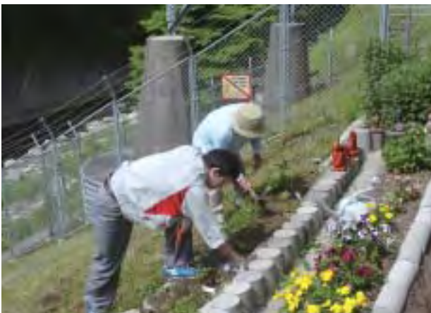
J-POWER Hashimoto Transmission Line Maintenance Office