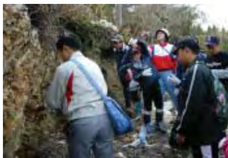
J-POWER Ohma Nuclear Power Project Construction Preparation Office