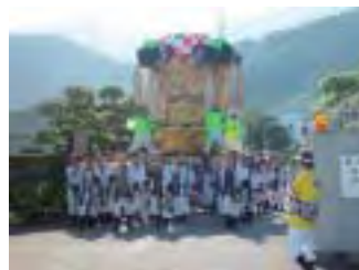
J-POWER West Regional Control Center