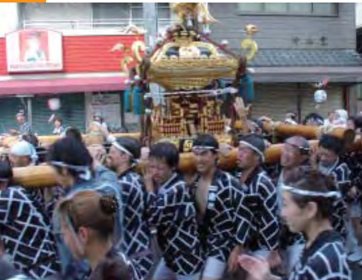
JP Business Service