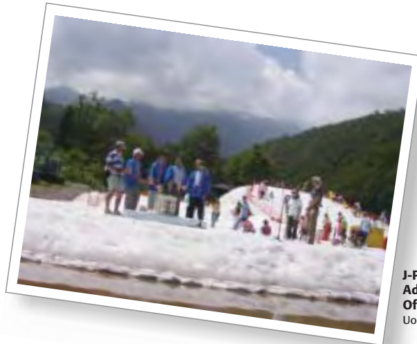
J-POWER Koide Power Administration Office, JPHYTEC Koide Office (Niigata Prefecture) Uonuma summer snow festival