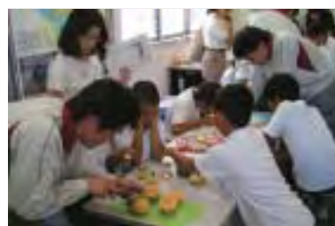
J-POWER West Regional Transmission Line Maintenance Center