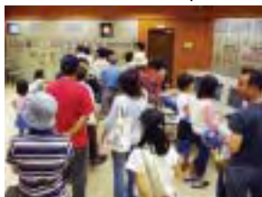
Thermal power simulator tour

J-POWER Wakamatsu Operations & General Management Office Wakamatsu J-POWER Group