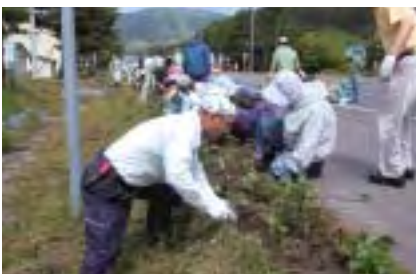
J-POWER Kitahon Power Administration Office (Hokkaido) Flower planting campaign