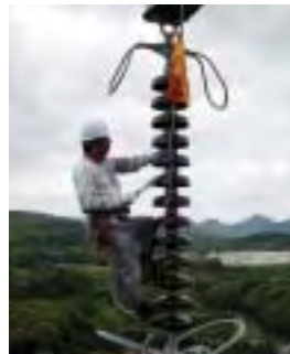
Inspection of insulators on the Matsushima Thermal Line in Nagasaki Prefecture