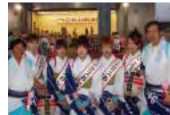
J-POWER Ohma Main-Transmission Line Project Construction Office