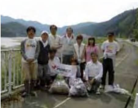
J-POWER Totsukawa Power Administration Office JPHYTEC Totsukawa Office (Nara Prefecture, Wakayama Prefecture) Cleanup along Kumano Ancient Road, a World Heritage site

Coinciding with Environment Month, a message from the president is posted at every organization and office in an effort to raise the environmental awareness of employees.