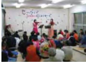
J-POWER Wakamatsu Operations & General Management Office (Fukuoka Prefecture)

We have also held smaller-scale community concerts at 70 welfare facilities, schools, and other locations around Japan as a part of our public service activities.