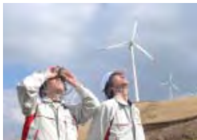
Inspection at the Aso-Nishihara Wind Farm in Kumamoto Prefecture

Maintaining the safety of our facilities and ensuring they inspire peace of mind in local residents is a major precondition for ensuring the stable supply of power.