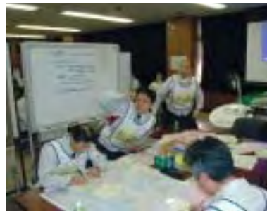
General disaster prevention drill

Each of our power stations runs drills several times a year that simulate a variety of potential accidents and natural disasters. The drills are designed to ensure appropriate actions are taken whenever an emergency occurs. General disaster prevention drills are conducted with coordination between the head office and local bodies. These drills have incorporated simulations since fiscal 2004. The general disaster prevention drill for fiscal 2005 was run in December.