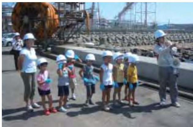
J-POWER Takasago Thermal Power Station JPec Takasago Company (Hyogo Prefecture) J-POWER tour during summer vacation

The local organizations of the J-POWER Group invite people of all generations, including local kindergartners, elementary school students, and members of neighborhood associations and senior citizens' clubs, on tours during which we explain our power stations and other facilities. Around 550 people nationwide participated in the tours during fiscal 2005.