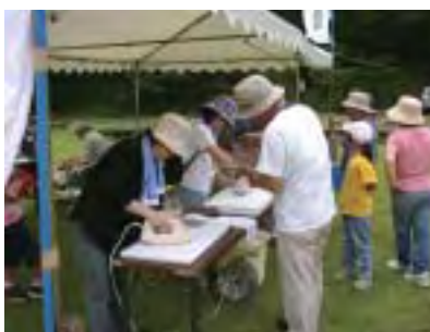
J-POWER Onikobe Geothermal Power Station JPec Onikobe Office (Miyagi Prefecture) Forest and lake enjoyment days