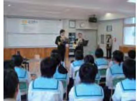
J-POWER Towa Power Administration Office, JPHYTEC Towa Office (Iwate Prefecture)