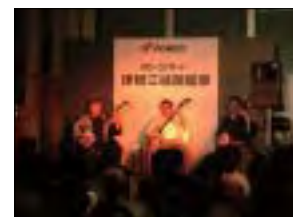
Tsugaru shamisen concert and photo exhibit held in the first-floor lobby