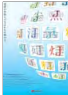
Advertisement that ran in the Asahi Shimbun newspaper on January 15, 2006

A number of these ads are featured in this report (see pages 5-7, 19, 33, and 62).