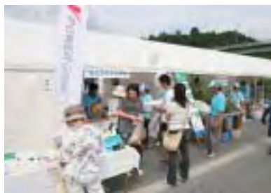
J-POWER Kochi Power Administration Office JPHYTEC Sameura Representative Office (Kochi Prefecture) Forest and lake enjoyment days