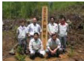
J-POWER Ohma Main-Transmission Line Project Construction Office