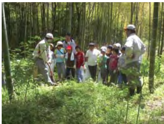
J-POWER Kouchi Power Administration Office