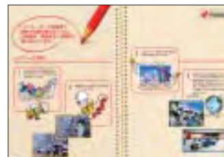
Oshiete J-POWER (Tell Me about J-POWER)