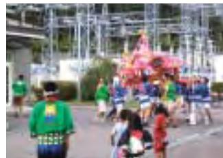
J-POWER Kitahon Power Administration Office