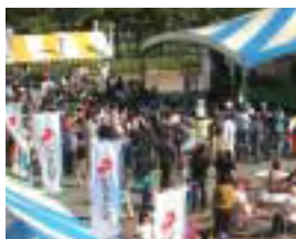
Event held at Matsuura in 2005

J-POWER Matsuura Thermal Power Station JPec Matsuura Company JP Business Service Matsuura Office KEC Corporation Matsuura Business Office J-POWER Matsushima Thermal Power Station