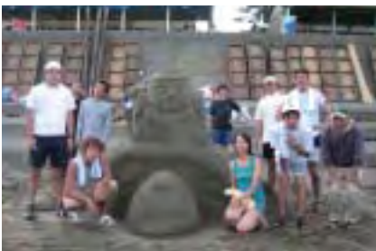
J-POWER Tachibanawan Thermal Power Station (Tokushima Prefecture) Anan marine festival sand sculpture contest