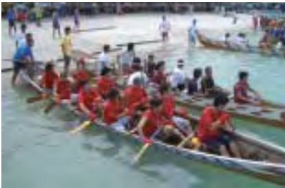
J-POWER Ishikawa Coal-Fired Power Station (Okinawa Prefecture) Maeganeku dragon boat races

We are committed to setting down roots in local communities and fulfilling our role as a good corporate citizen that contributes to the development of the community. Given this commitment, we participate in local events, provide support for them as a sponsor, and otherwise participate in community life.