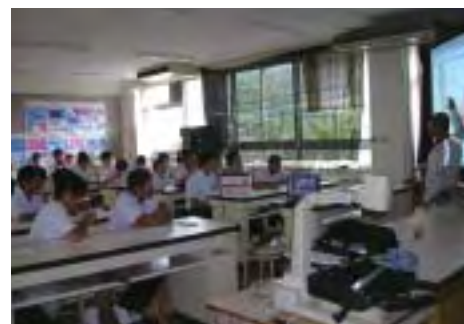
J-POWER Matsuura Thermal Power Station