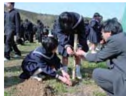
J-POWER Tachibanawan Thermal Power Station (Tokushima Prefecture) Shokawa cherry tree planting