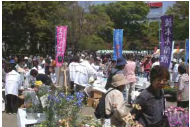
J-POWER Isogo Thermal Power Station, JPec Isogo Company, JP Business Service Isogo Office (Kanagawa Prefecture) Yokohama spring flower and plant fair