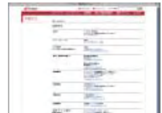
“Contact Us” page on J-POWER’s website

We strive to keep interactive communication open with the public through our website, www.jpowers.co.jp/english/ , which features information on contacting us via e-mail or telephone.