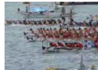
J-POWER Matsushima Thermal Power Station