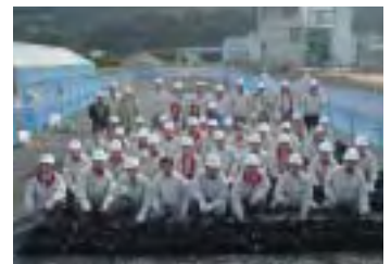
Wakamatsu J-POWER Group