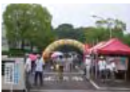
Takehara facility opened to the public for a daylong event

J-POWER Takehara Thermal Power Station J-POWER Group